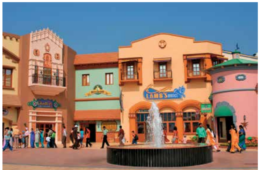
Illustration: Swapnil Redkar, DINODIA/Dinodia Photo/Dinodia

Spread on a sprawling 2,000 acres, Ramoji Film City was established by film producer Ramoji Rao in 1996. It is the largest film studio complex in the world. Watch a variety of live shows—ceremonious opening and closing acts, various cultural performances and stunt shows—while learning about film-making and sound-mixing. A bird park with several species of exotic birds and the numerous gardens will leave you mesmerised. Guided tours for visitors are organised in charming, vintage-looking buses. Here you can see replicas of several historical sites and buildings including the Mughal Gardens, Hawa Mahal and Statue of Liberty.